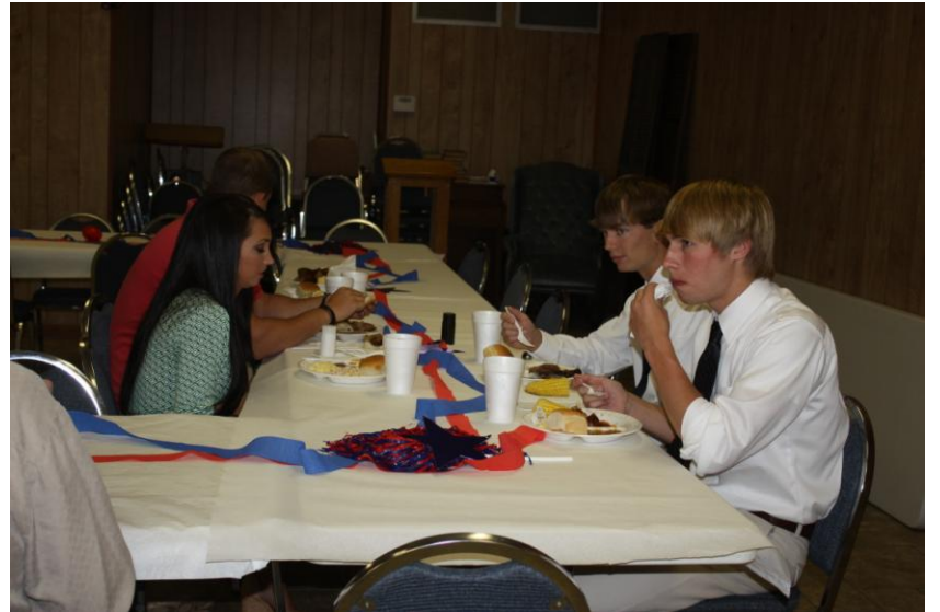
Graduates and their families enjoying lunch in the FLC