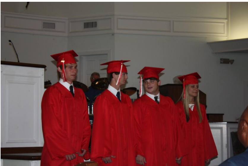
Introduction of the Graduates